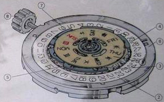
1 Day Dial